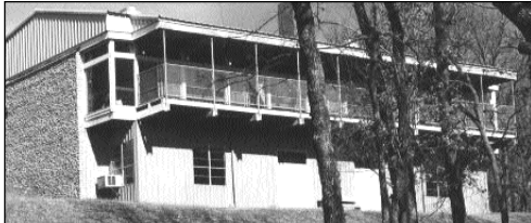
Back of dining hall overlooking the lake Dining hall doubles as dance hall with WOOD FLOOR!

Musicians can jam, play for dancing and lead workshops in tunes or techniques. Callers and others can lead a dance session (contra, square, Eng. Country, couple dance) a song session, kids activity (if enough kids attend) or just dance. The content of the schedule is largely dependent upon the skills of and suggestions made by those attending. See the registration form.